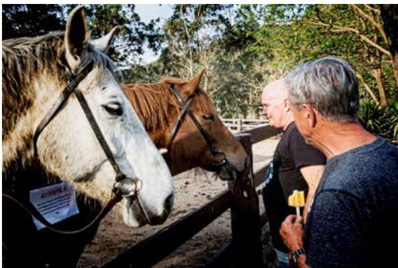
"The Horse Whisperers" Outing to Glenworth Valley September 2017