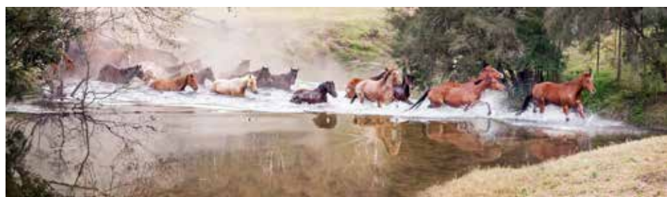
The crossing on 16th September (above) and on 23rd September (below)