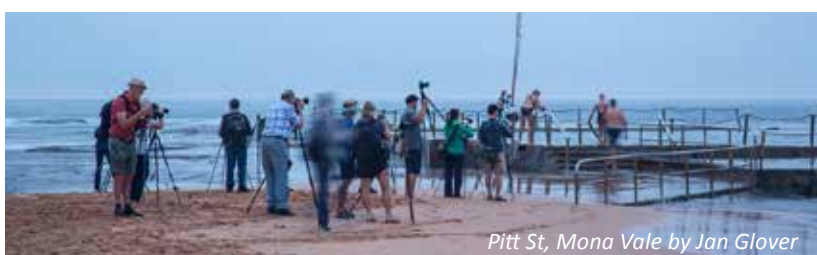
Pitt St, Mona Vale