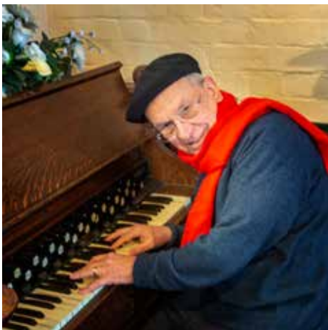
"Some French Geezer"