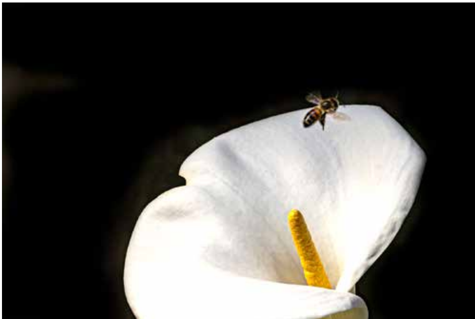
Bee Scene by John Pettett Wildwood Garden outing - September 2018